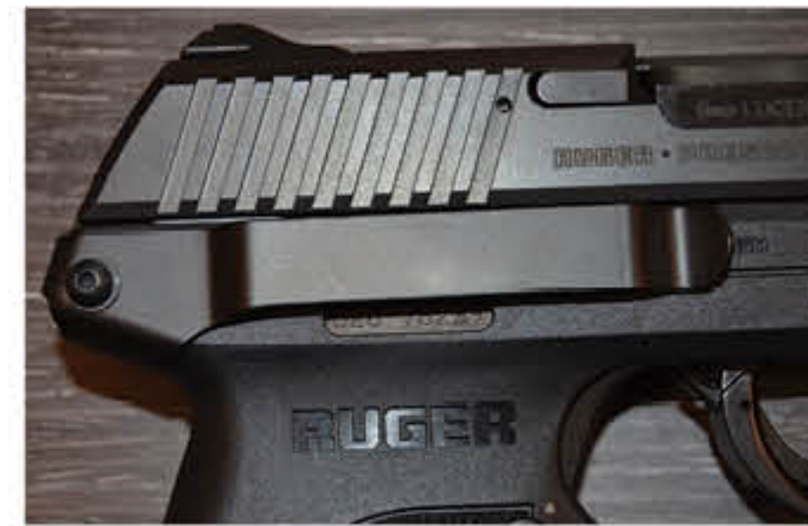
The convenient concealable Techna Clip.

A good holster is desirable accessory, but sometimes simpler is better. Techna Clip is a minimalist solution for those who carry concealed. It is gun clip that easily affixes to your sidearm for a secure, lightweight and discreet carry option. Once installed on your firearm carry is as simple as stuffing it your pants in whatever position you want. It holds securely and eliminates the bulk of some holsters. The Techna Clip has three easy installation methods depending on the type of firearm. One method replaces the rear frame pin on the gun and replaces it with a post that is drilled and threaded that allows the clip to be fastened to the firearm with a screw. The second one replaces the plastic slide backplate with a billet backplate that is drilled and tapped. The clip is then fastened to the backplate by two screws and ready to use. The third way requires the removal of the grip plate, the belt clip is then placed on the frame of the gun and the grip plate is then replaced